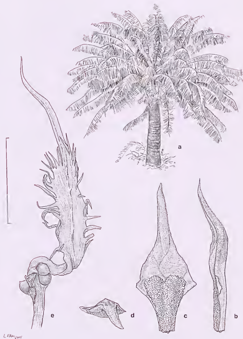
Fig. 3. Cycas aenigma . a, habit. b, c, d, male sporophyll. e, female sporophyll (a,b,c,d from K. Hill slides of Fernando E 1617 , e from K. Hill slide of Fernando E 1618 ). Scale bar: a = no scale; b,c,d = 4 cm; e = 6 cm.